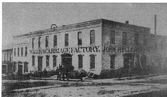
THE HOLLENSTEIN WAGON SHOP ABOUT 1890 NOW THE MAYVILLE MUSEUM

A special thanks to both of Mayville's Historical Societies that helped so much with this book by providing information and many years of historical experience.