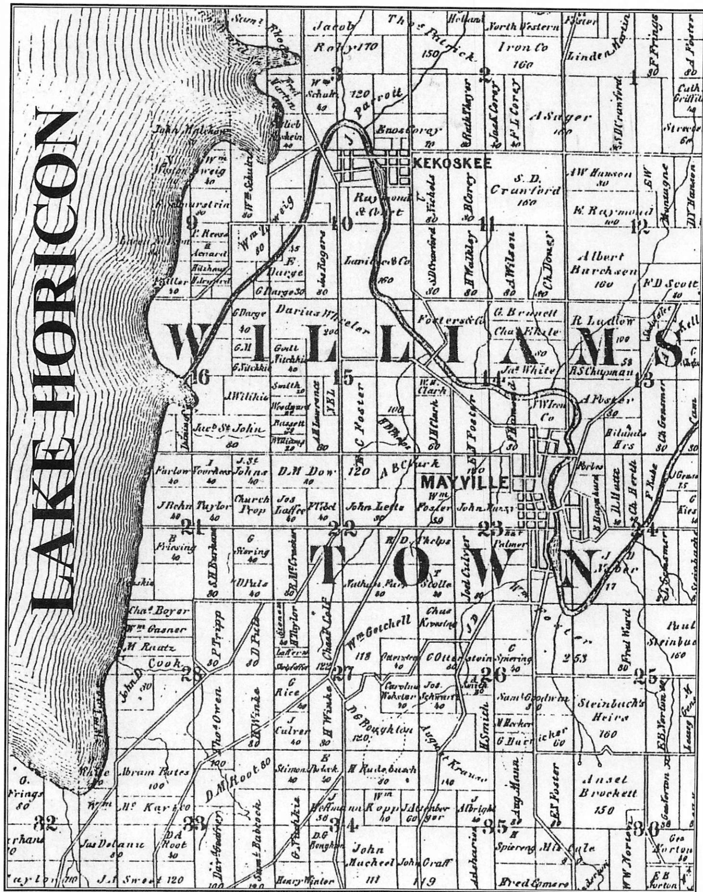
Town of Williamstown Plat Map with Lake Horicon - 1859